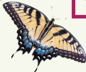
TIGER SWALLOW TAIL