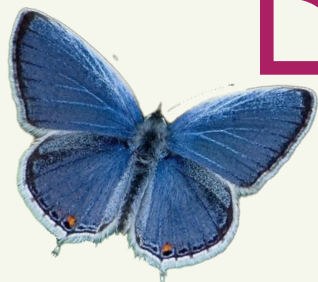
EASTERN TAILED BLUE