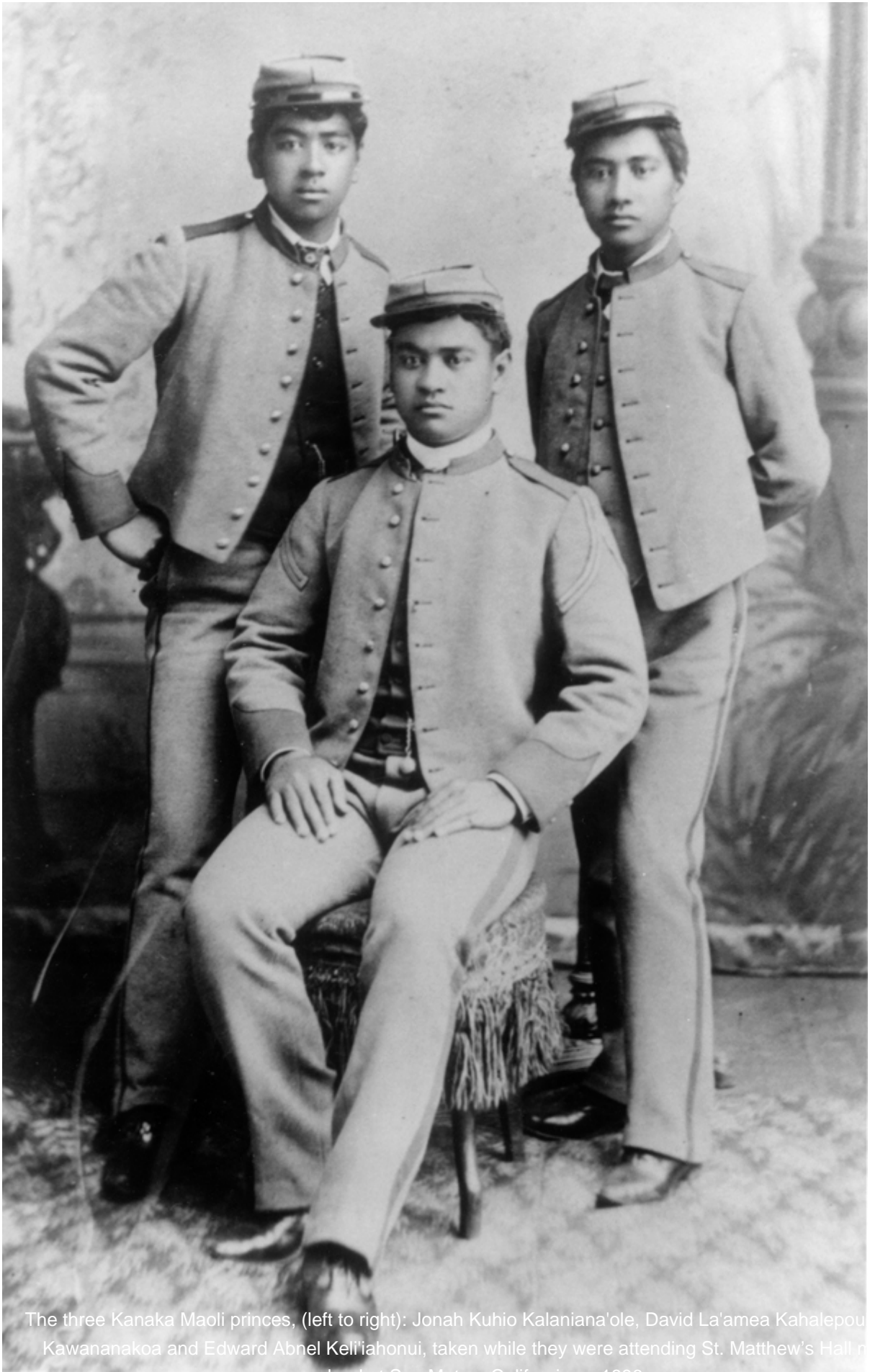
The three Kanaka Maoli princes, (left to right): Jonah Kuhio Kalaniana'ole, David La'amea Kahalepouliu, Kawanakoa and Edward Abnel Keli'iahonui, taken while they were attending St. Matthew's Hall in San Francisco, California, 1890.