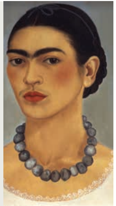
Frida Kahlo, Self-portrait with Necklace , 1937