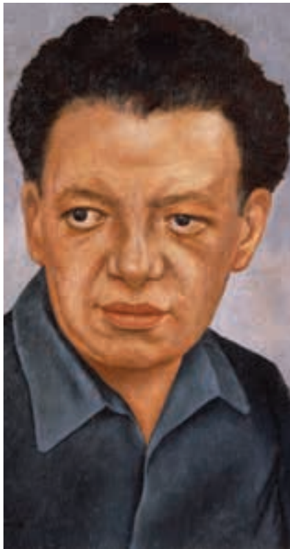
Frida Kahlo, Portrait of Diego Rivera , 1937